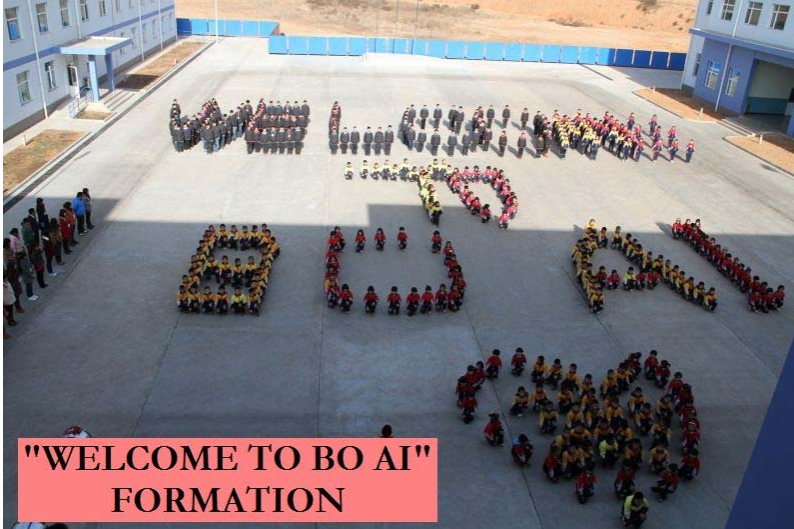
"WELCOME TO BO AI" FORMATION