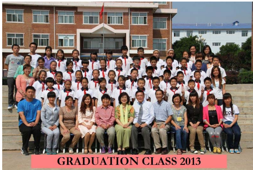
GRADUATION CLASS 2013

In late October, Bo Ai formed its first ever Student Council . I am proud to tell you that 34 6 th , 7 th and 8 th grade students stepped forward to vie for the position of President and two Vice Principal positions. They presented themselves very well at the election with speeches, Power Point presentations and even dance to let the school know what they would do if they had won the positions. The President and two Vice Principals then decided that those who lost would fill positions in the five committees. Listening