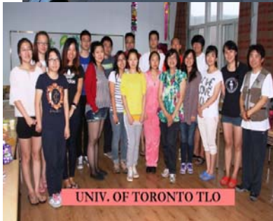
UNIV. OF TORONTO TLO