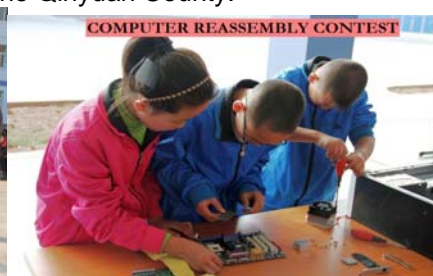
COMPUTER REASSEMBLY CONTEST