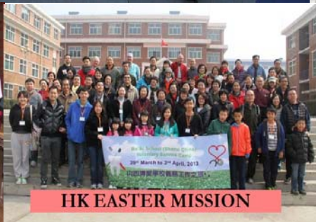
HK EASTER MISSION