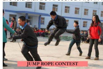
JUMP ROPE CONTEST