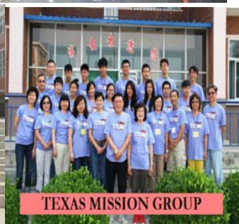
TEXAS MISSION GROUP